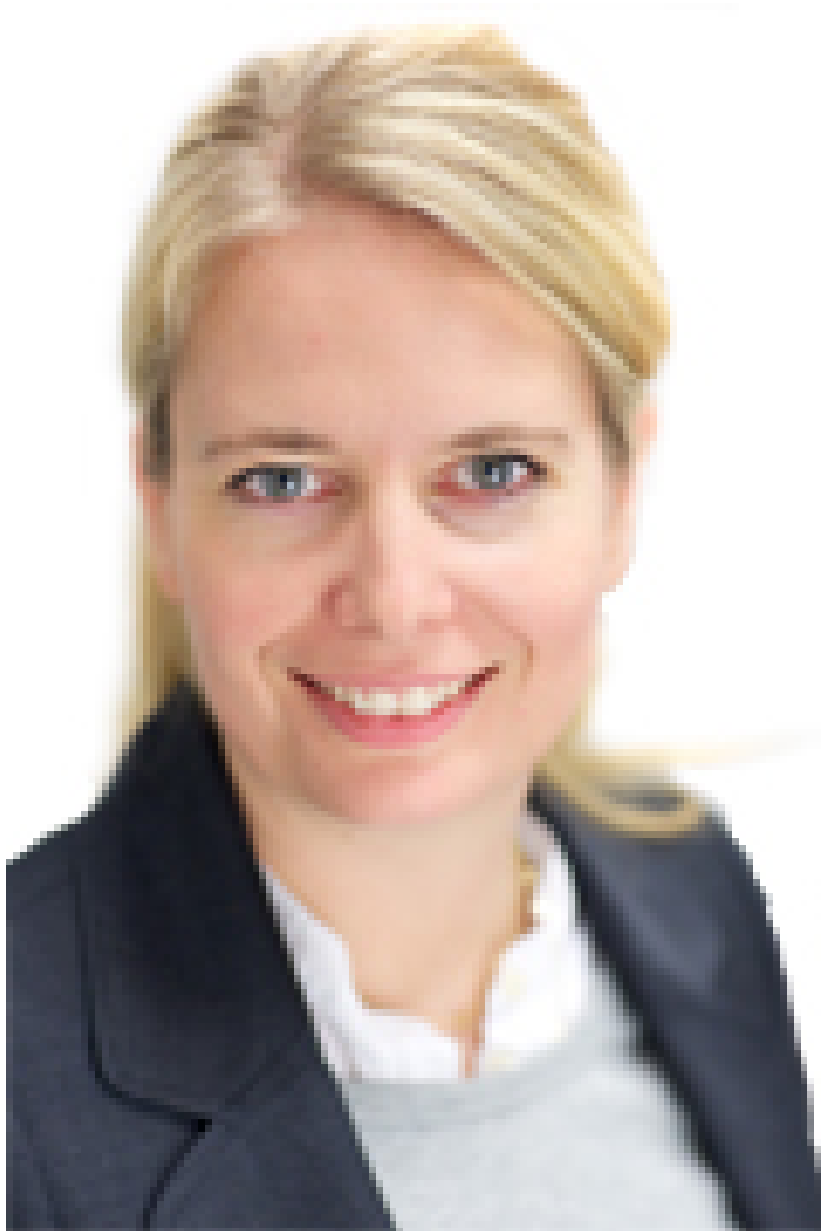
Resident Expert for Taxation.